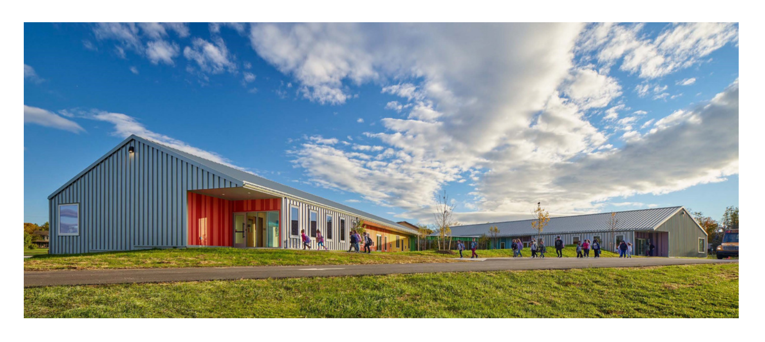
Please contact the office with any questions.